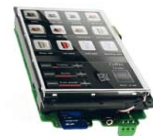
The CQube can be fitted with optional touch display.