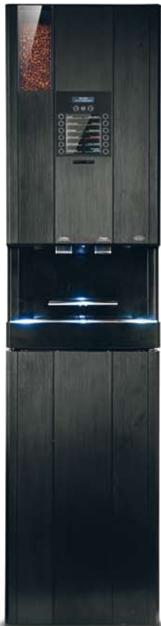
CQube L Carbon black with base cabinet