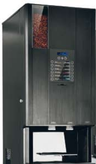
CQube L Carbon black Table top