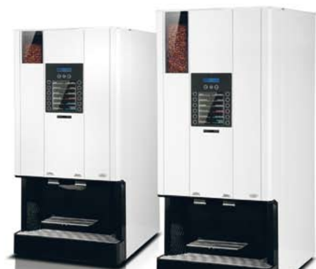
CQube M Crem white Table top