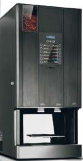
CQube M Carbon black Table top