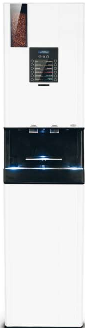
CQube L Crem white with base cabinet