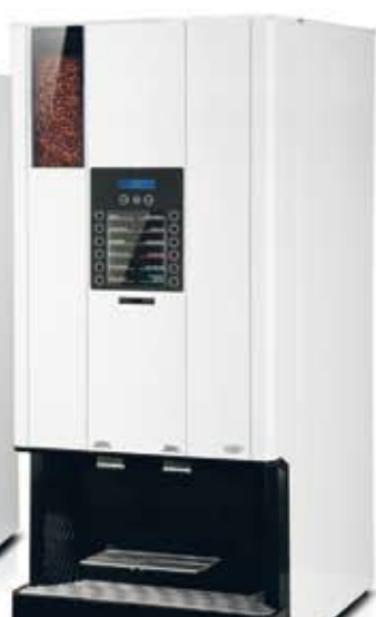
CQube L Crem white Table top